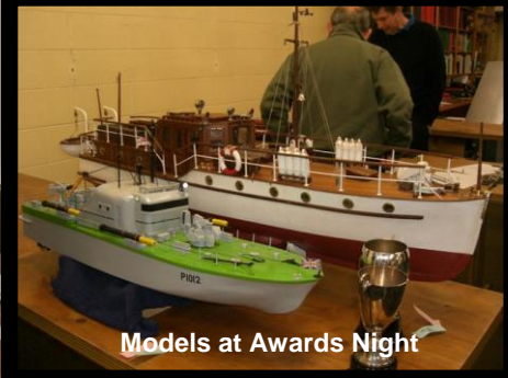
Models at Awards Night