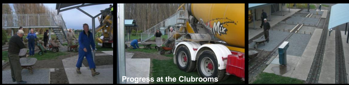
Progress at the Clubrooms