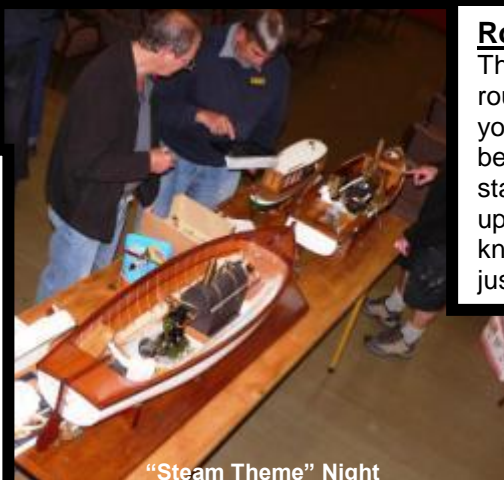
"Steam Theme" Night