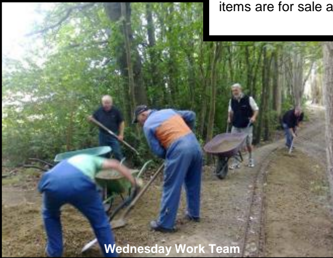
Wednesday Work Team