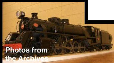
Photos from the Archives