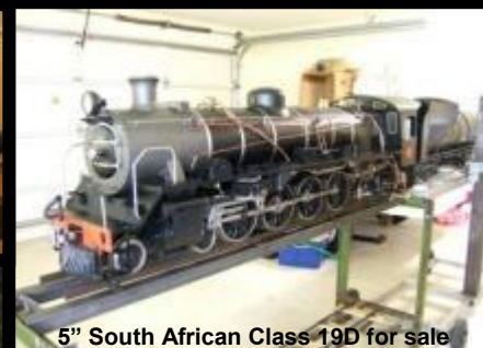
5" South African Class 19D for sale