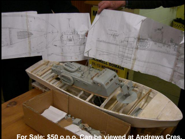
For Sale: $50 o.n.o. Can be viewed at Andrews Cres.