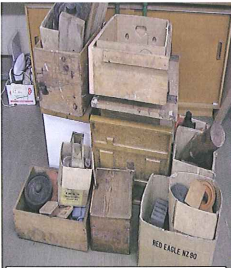
Free wooden patterns at Andrews Cr.