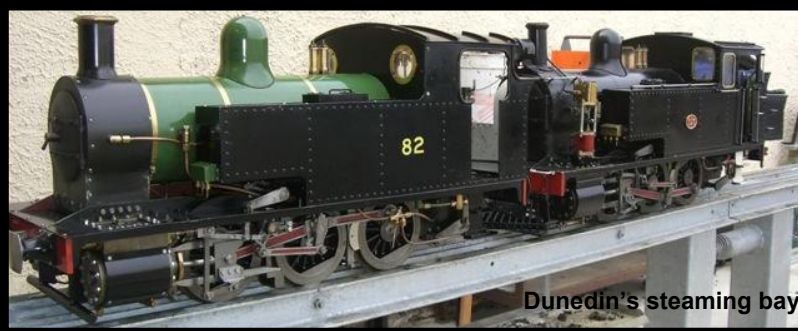
Dunedin's steaming bay