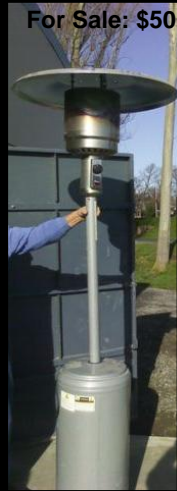
For Sale: $50