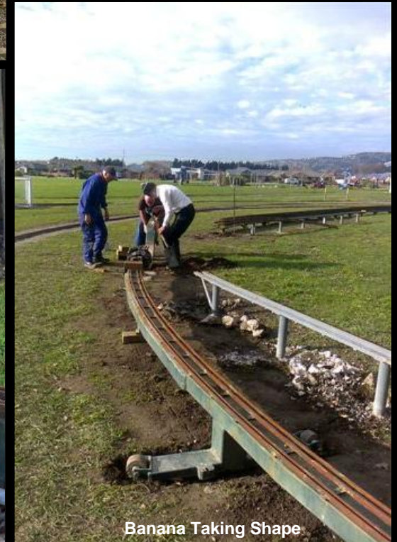
Banana Taking Shape

Any suggestions, comments or items for inclusion in the bulletin can be sent directly to thatwhillslot6@kinect.co.nz