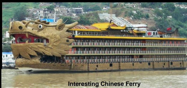
Interesting Chinese Ferry