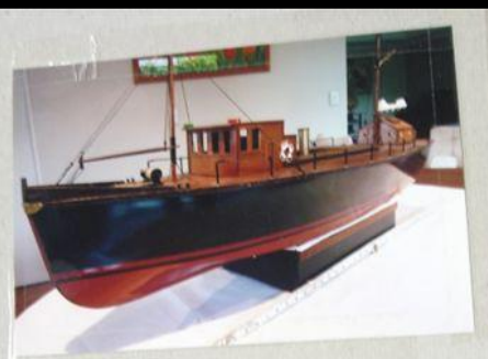
Boat For Sale (see Left)