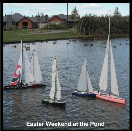
Easter Weekend at the Pond