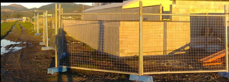
Progress with the Engine Shed Extensions