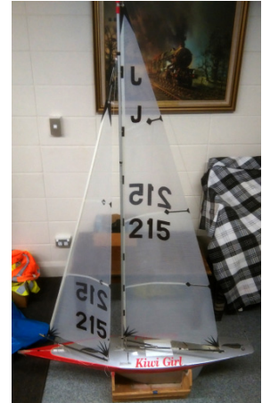
'J' Class yacht