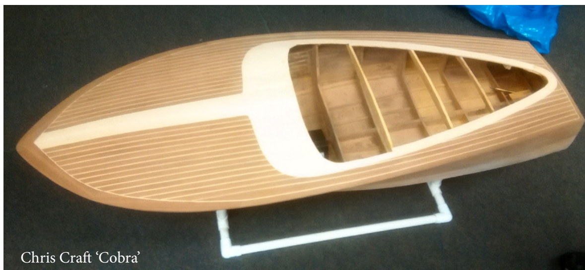
Chris Craft 'Cobra'