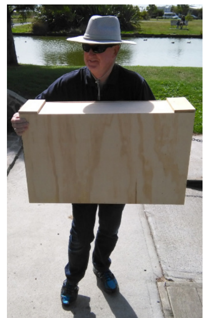
Needs a Caption....