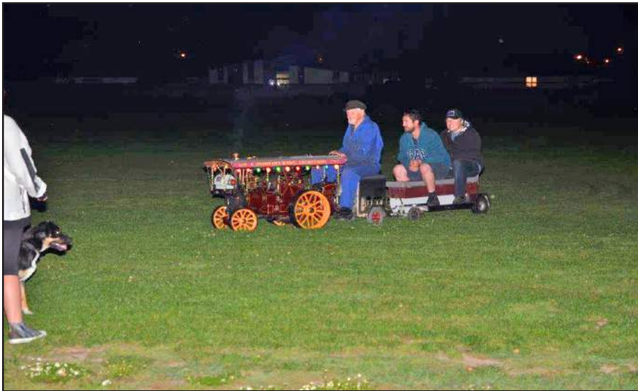
Night Run, April 2016