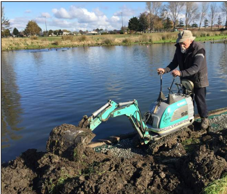
Jimmy the Digger and Lil' Scoop

(because he was cajoled into it, I tell you!!!)