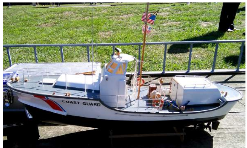
Aaron Pringle: Lifeboat