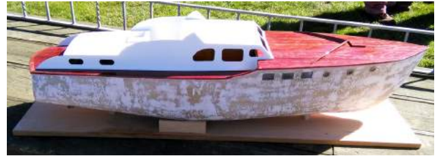
Keith Schroder: Cabin cruiser nearing completion