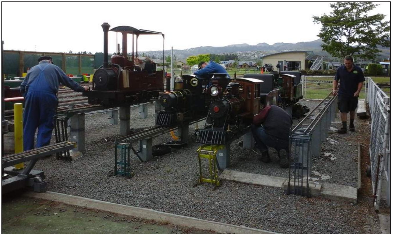
Above: Preparations for Show Weekend Overleaf: Design for the two tunnels