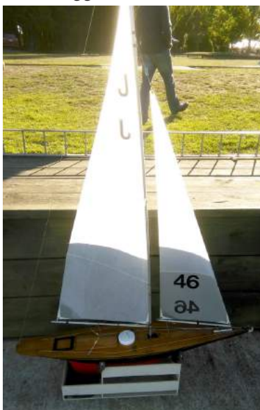
J' Class Yacht