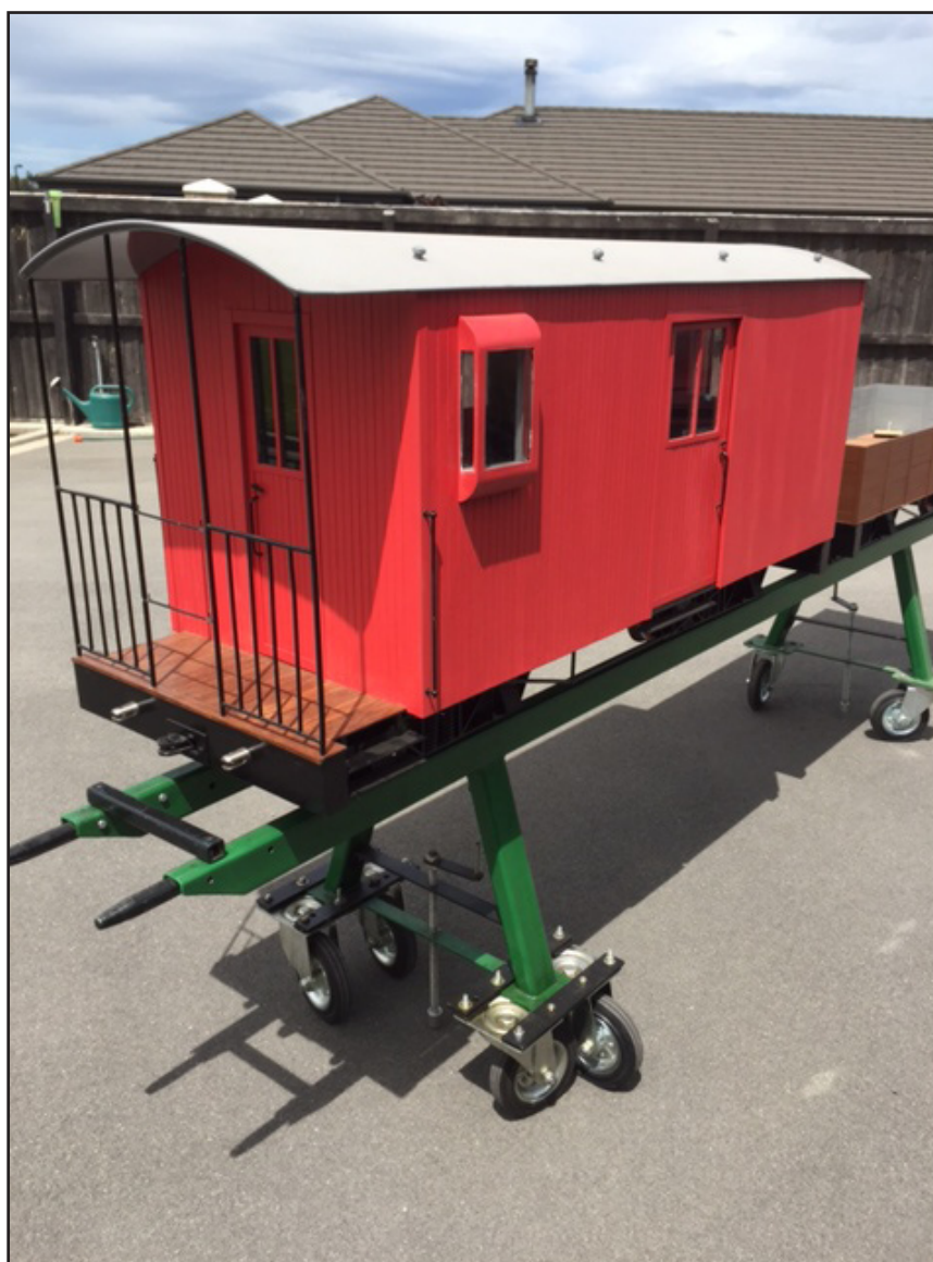
Best entry overall: Cyril Fifield's 7 1/4 " gauge Guard's Van

For full details, go to our website: csmee.org.nz