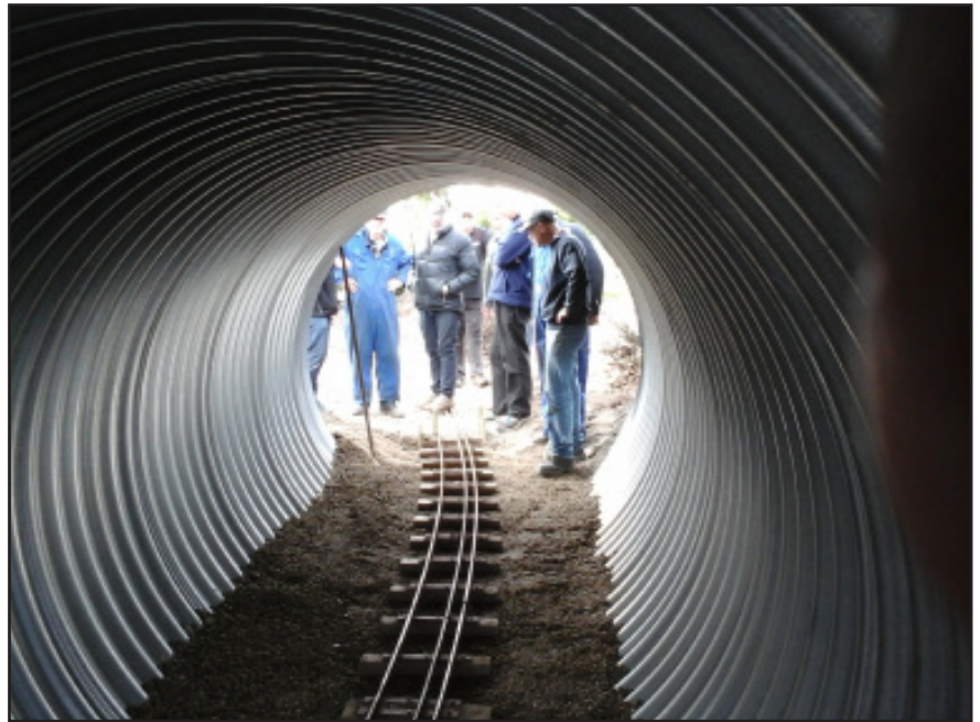
View through the tunnel