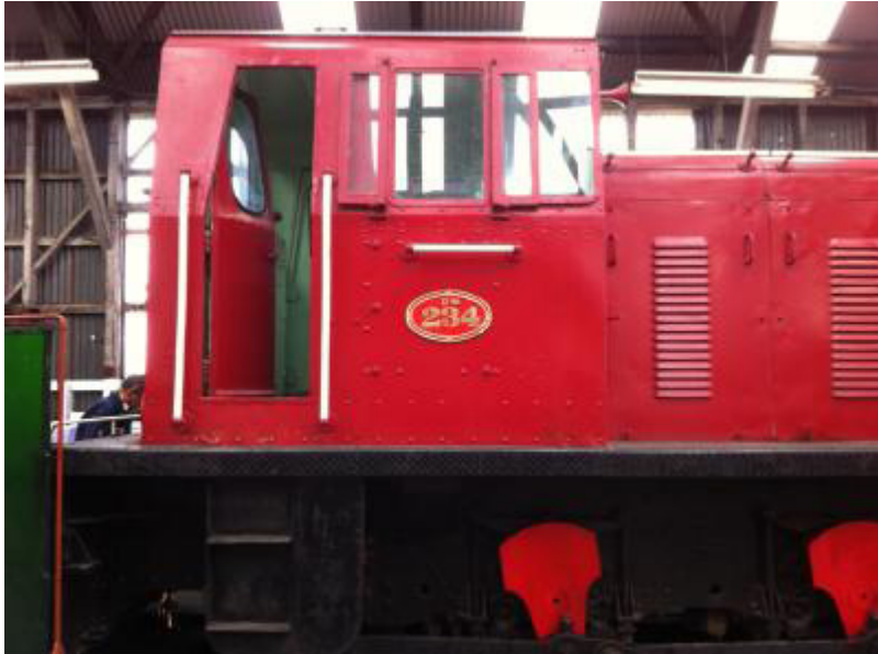
Side view of DSA 234, Bagnall 0-6-0, at Oamaru Steam & Rail Society.

(See Vol.41, March 2016 , for details of the origins of this project, now completed).