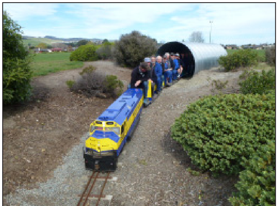
First train through the tunnel